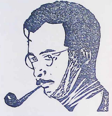
Fig. 43PC7 Typo-Grapher

In a quick run through the same issue I found no less than ten. This is probably about par and indicates that Dean's observatioal faculty